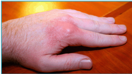
Figure 1: Acute gout episode with a swollen, red and painful finger

Gout is a type of arthritis that results in sore joints. With this type of arthritis, crystals form in the joint. This causes irritation that is sometimes also present in the tendons near the joint. Joints can become swollen, painful, and red (Figure 1). This condition can affect any joint in the body. The first gout attack often occurs in the big toe. The elbow, wrist, and finger joints are also common sites. Painful swelling can come and go in the same joint or in different joints.